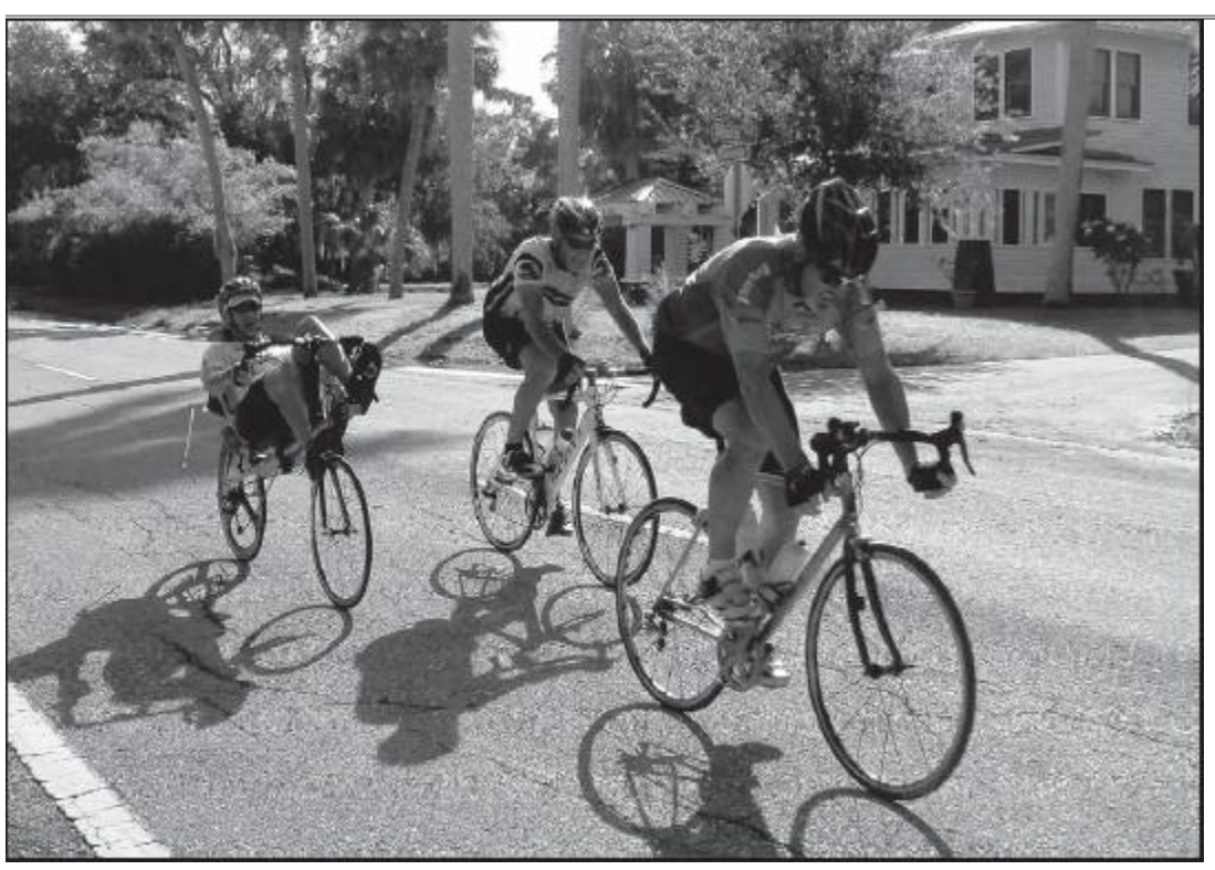
A trio of bikers rides on Riverside Drive.