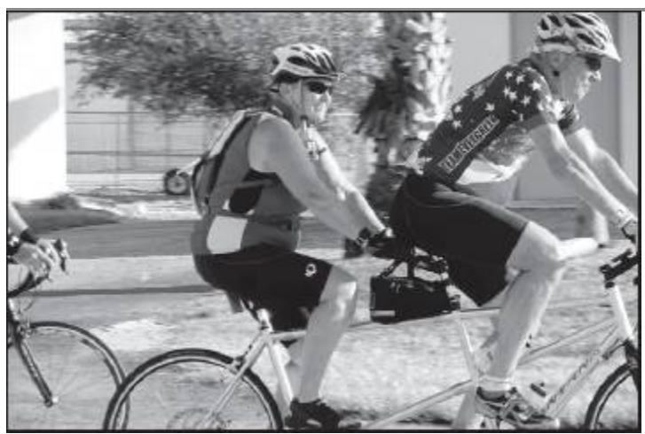
For these participants, a bicycle built for two was just the right speed, during the Peace River Riders event Saturday.

Riders get ready to embark Saturday morning from a Punta Gorda parking lot during a Wheels & Wings event.