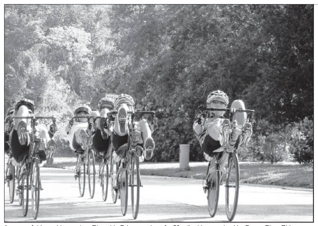
A group of riders whirs west on Riverside Drive on a leg of a 50-mile ride organized by Peace River Riders on Saturday.